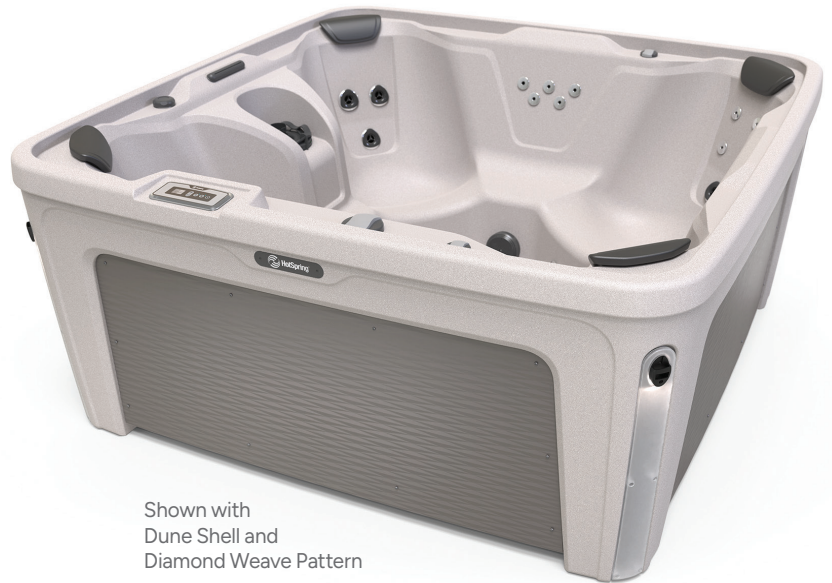
Shown with Dune Shell and Diamond Weave Pattern