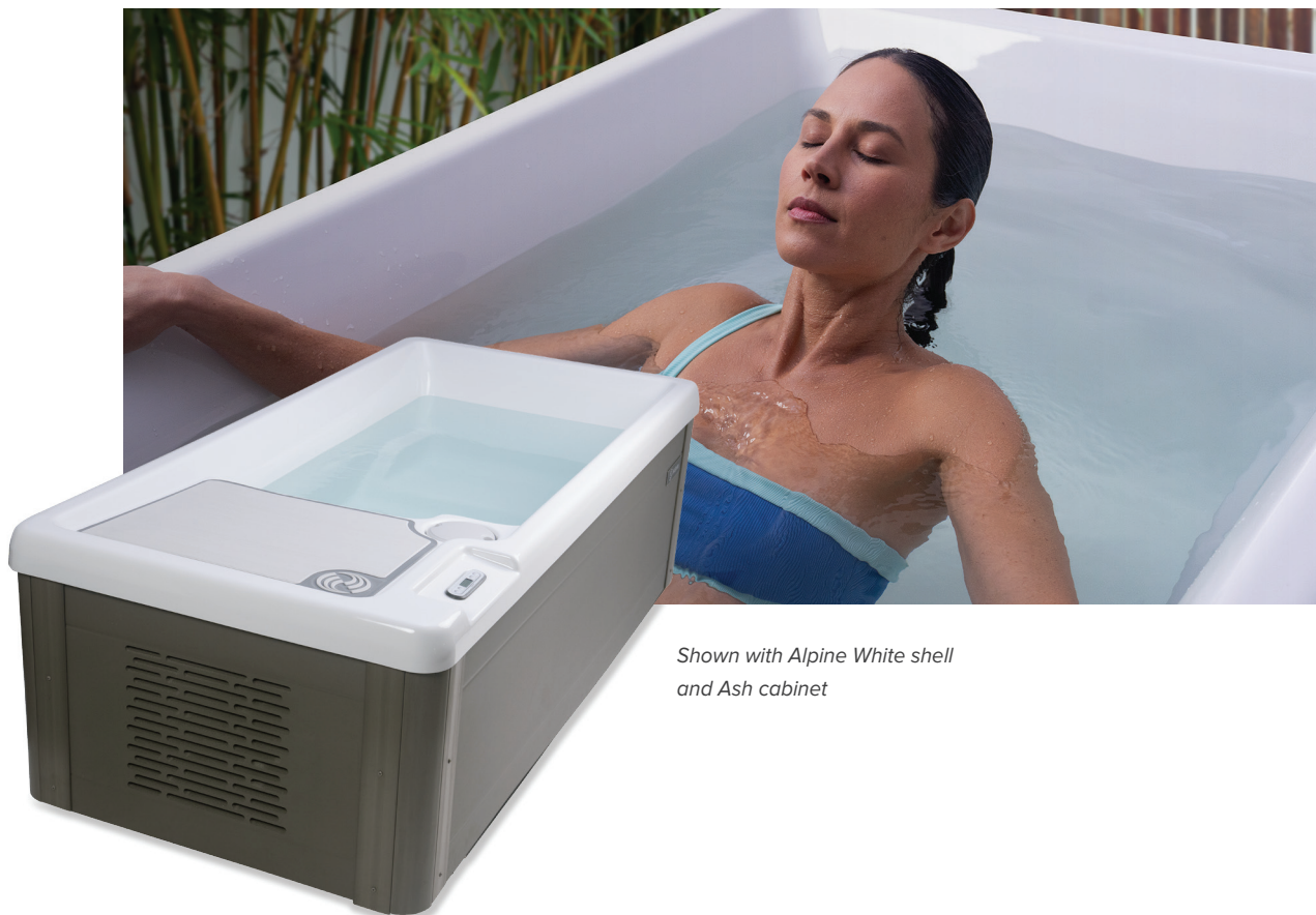
Shown with Alpine White shell and Ash cabinet