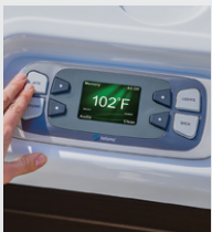
Colour LCD Display