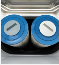
Dual Action Filtration SilentFlo Circulation