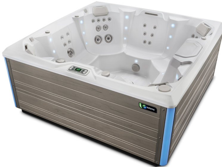
Shown with Alpine White Shell and Coastal Grey Cabinet