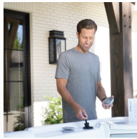
FreshWater® Salt System Ready