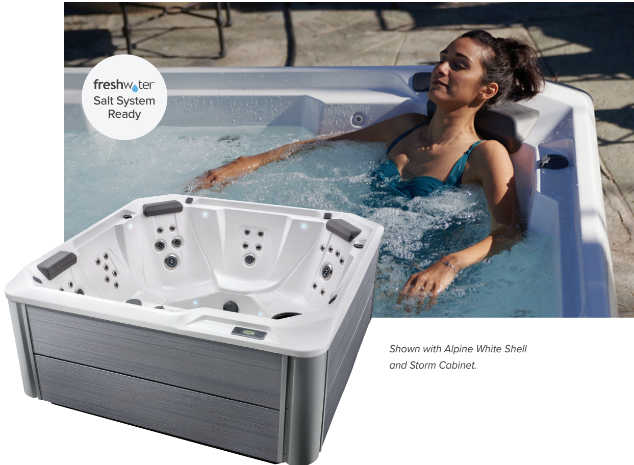
Shown with Alpine White Shell and Storm Cabinet.