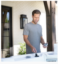
FreshWater® Salt System Ready