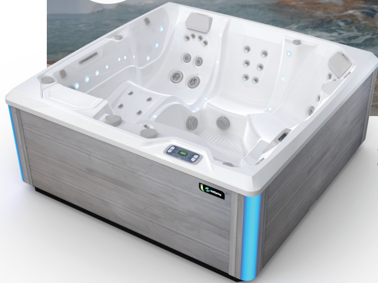
Shown with Alpine White Shell and Coastal Grey Cabinet