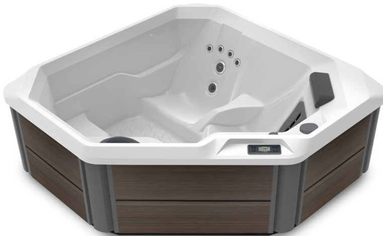
Shown with Alpine White Shell and Havana Cabinet.

People Seating Jets Voltage 2 Seats Open 11 Jets 230 V/ 16 amp