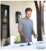
FreshWater® Salt System Ready