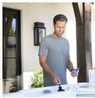
FreshWater® Salt System Ready