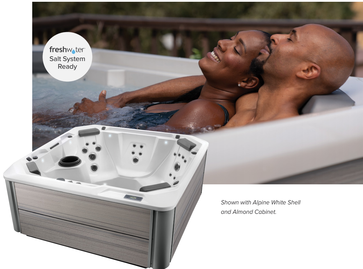
Shown with Alpine White Shell and Almond Cabinet.