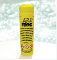
Frog® In-Line Sanitising System