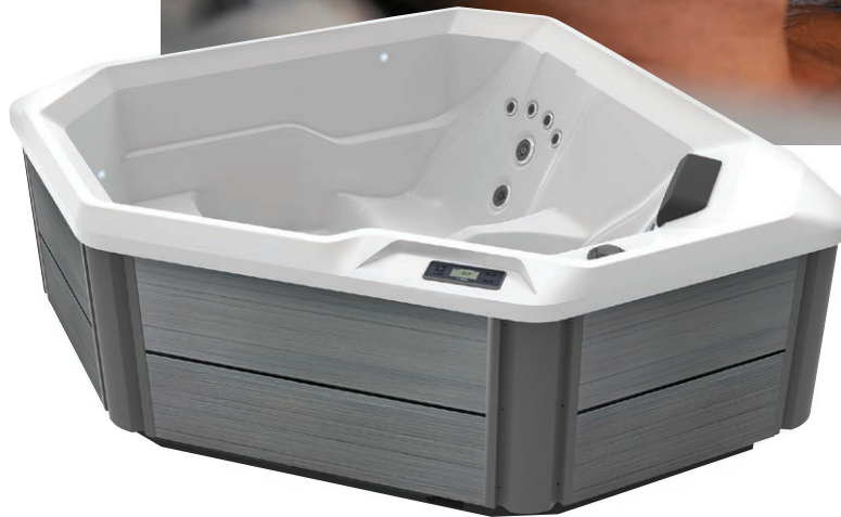
Shown with Alpine White Shell and Storm Cabinet.