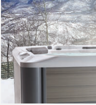
FiberCor® High-Density Insulation