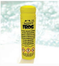
Frog® In-Line Sanitising System