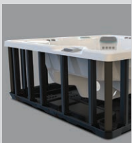
Polymer Substructure & Base Pan