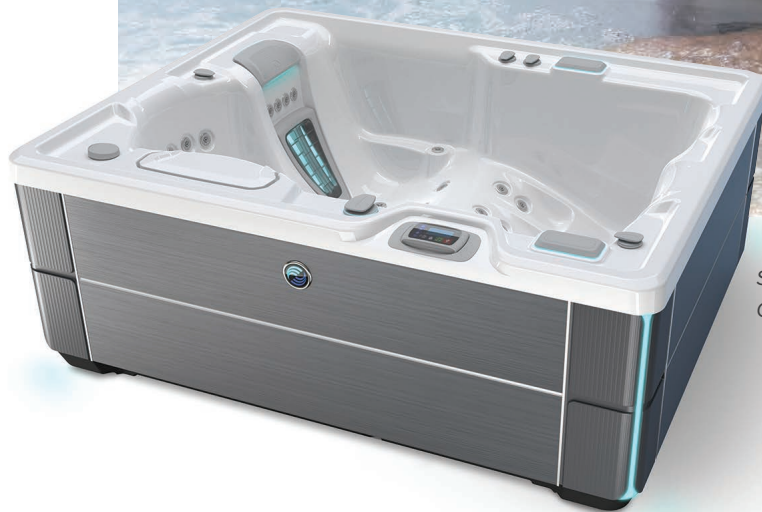
Shown with Alpine White Shell and Charcoal Cabinet

People Seating Jets Voltage 3 Seats Lounge 30 Jets 230 V/ 16 amp