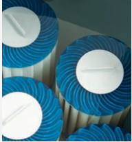
100% Filtration SilentFlo Circulation