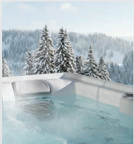
Super Energy Efficient