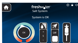
Touch Screen Display

Using a FreshWater 5-Way Test Strip, check the water to ensure a residual chlorine level of a minimum of 3 ppm has been maintained over the past 24 hours. If the chlorine level has dropped below 3 ppm, repeat the chlorination process to achieve 5 ppm and press the Boost button. Check the chlorine level again in 24 hours, and continue the chlorination and Boost process each day until the salt system can independently maintain the target 3 ppm chlorine residual. Over the next few days, continue to test your water using a FreshWater 5-Way Test Strip and adjust the salt system output level as needed.