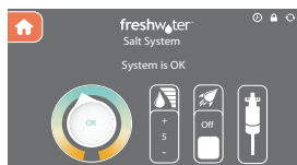
Touch Screen Display